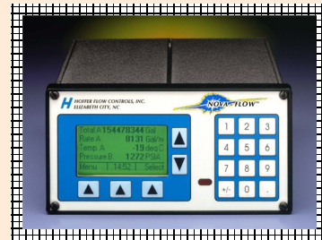
Nova-Flow Computer (Refer to Nova Flow Technical Data Sheet)