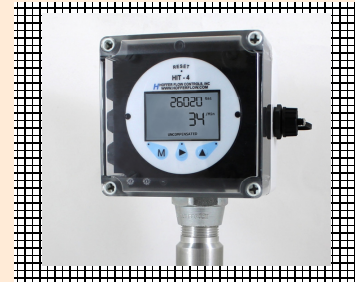
HIT-4U Rate Indicator / Totalizer (Refer to HIT-4U Technical Data Sheet)